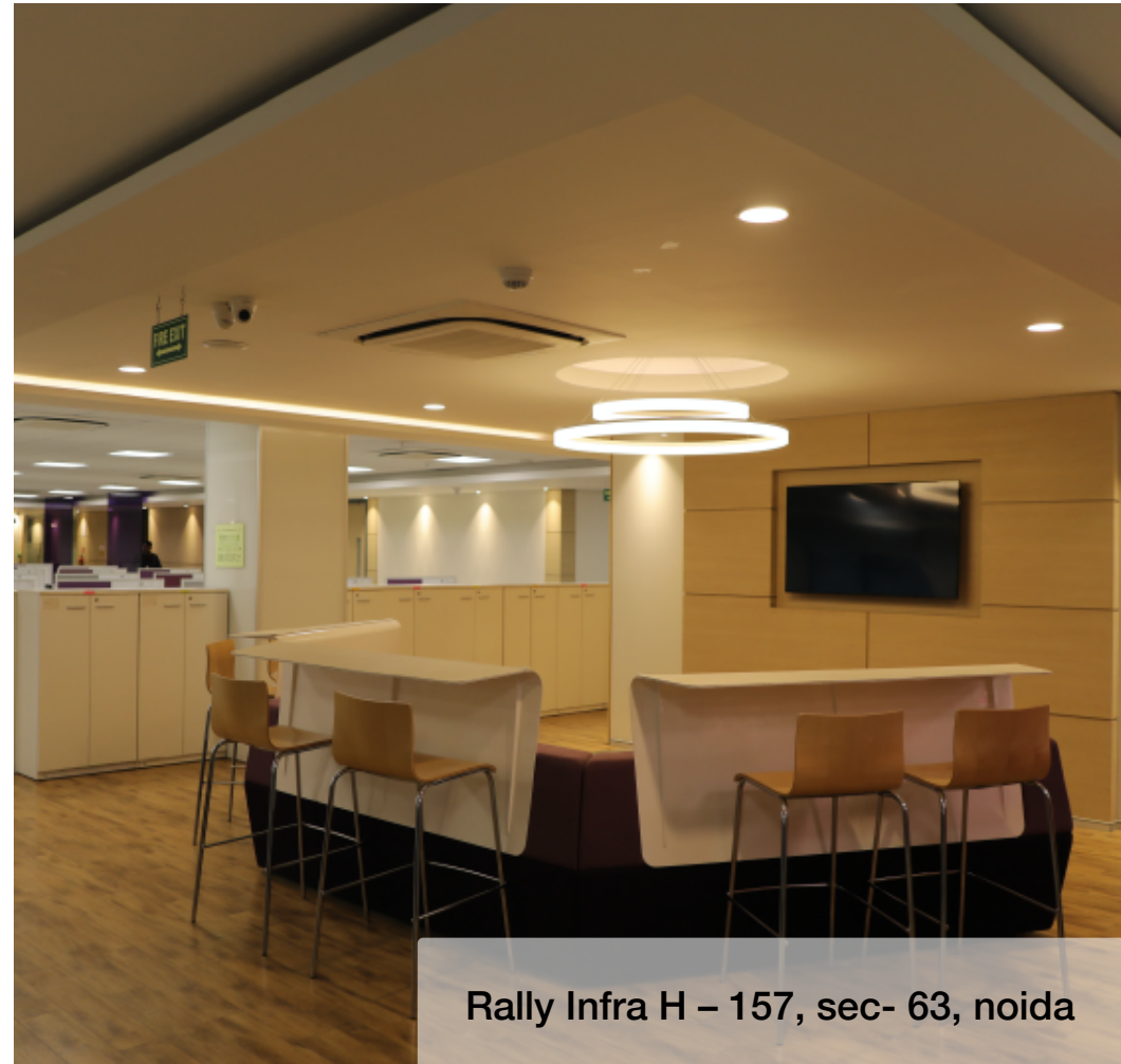
Rally Infra H – 157, sec- 63, noida