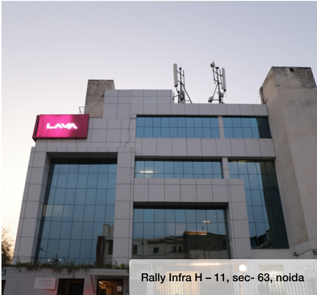
Rally Infra H – 11, sec- 63, noida

Located at the heart of Noida's business scene, Rallyinfra's coworking space on Golf Course Road puts you right in the action. Two floors in this iconic high-rise are elevated office space, featuring refreshing lounge areas, unique conference rooms, and sleek private offices that solve for your team's productivity. Commuting is a breeze with onsite parking and the Sector 62 (Electronic City) Metro Station within walking distance.